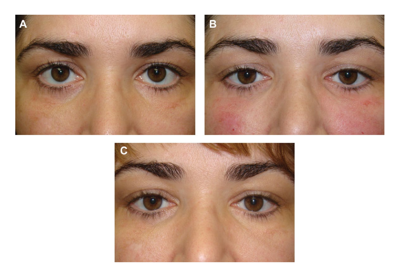
Figure 5. This 36-year-old woman presented with bilateral lower eyelid retraction 7 months after transcutaneous lower blepharoplasty (A) before, (B) immediately after, and (C) 3 months after volume-augmentation lower eyelid stenting with hyaluronic acid (Restylane; Medicis Aesthetics, Inc, Scottsdale, Arizona), which corrected the eyelid retraction.