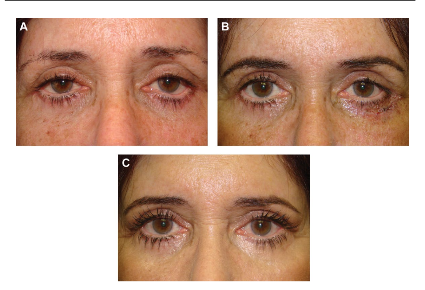
Figure 4. Eleven months after transcutaneous lower blepharoplasty, this 57-year-old woman presented with left lower eyelid retraction (A) before, (B) 2 weeks after, and (C) 9 months after skin grafting of the left lower eyelid and 4 injections of 5-fluorouracil for wound modulation.

had undergone transcutaneous surgery who do not have this problem (which is more common). Clearly, there are cases in which transcutaneous surgery is more appropriate; careful preoperative evaluation of these patients is essential to reduce the risk of PBLER.